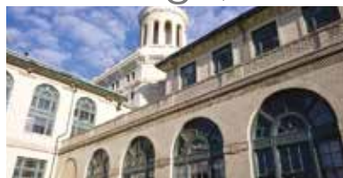
The Carnegie Mellon University.

Promoting education is a priority for the Foundation, and over the years several large grants have been made. One example, which combines the furtherance of education with medical research into children's health, is the programme of donations to the Carnegie Mellon University in Pittsburgh, of which a significant part is devoted to the Infant Lab Suite, where researchers are working to understand infant development to help children with disabilities such as autism and specific language impairment.