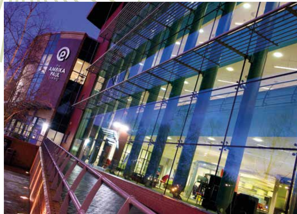
University of Wolverhampton