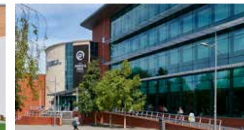
Left: Lord Swraj Building. Right: Ambika Paul Building.