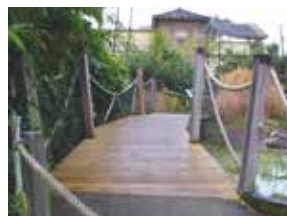
Top: Statue of Ambika at the London Zoo, book dedicated to Ambika and the Hippo Enclosure at the Zoo. Bottom left: Zoo entrances and the Bridge in the African Aviary.