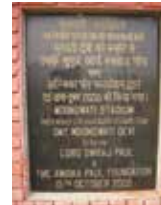
The Sports Stadium and plaque in Charkhi, dedicated to Lord Paul's mother Mongwati Devi.

The Foundation also made a sizeable contribution towards the opening of the Mongwati Stadium in Charkhi, India. This fully fledged stadium, named in memory of Lord Paul's mother, is part of the school and is also an invaluable asset to the local community of Charkhi village.